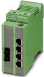
Ethernet Lean Managed Switch with four 10/100 Mbps RJ45 ports and one 10/100 Mbps FX-ST single-mode port

Please be informed that the data shown in this PDF Document is generated from our Online Catalog. Please find the complete data in the user's documentation. Our General Terms of Use for Downloads are valid ( http://phoenixcontact.com/download )