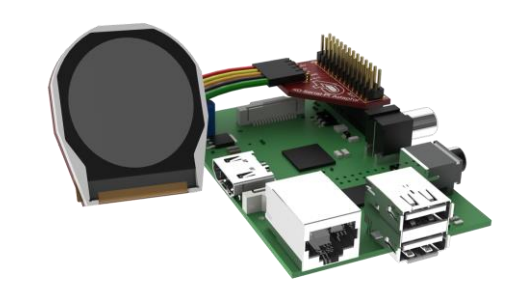
The uLCD-220RD-PI Pack connected together (Note: Raspberry Pi NOT included)